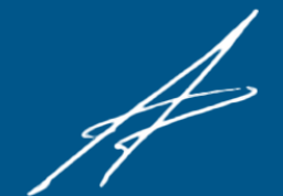
Scott Moe Premier of Saskatchewan