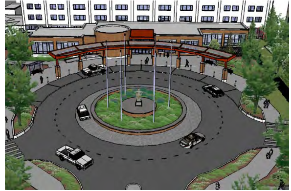
An early rendering of the new entrance at St. Paul's Hospital.

Upon completion, this project will improve safety, accessibility, patient flow and establish a First Nations and Métis Cultural Healing Centre equivalent to those at Regina General and Pasqua Hospitals. The new Healing Centre will offer space for celebration of culture and for patients to seek culturally safe healing.