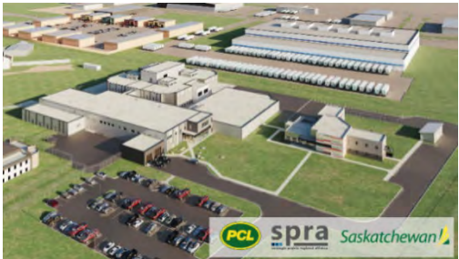
Rendered images of the Remand Centre expansion.