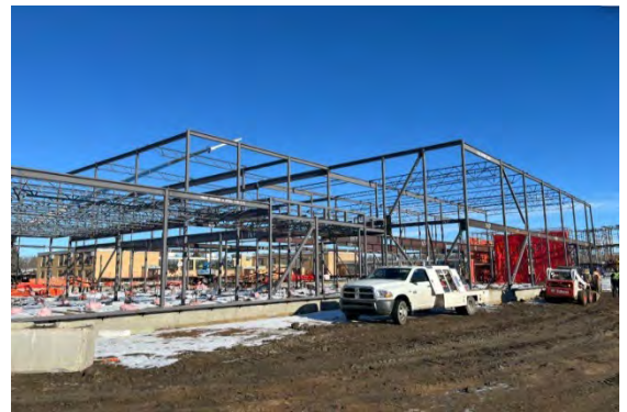
Construction progress on the new north Regina joint-use school.

This facility will provide space for approximately 800 pre-kindergarten to Grade 8 students, 400 Public and 400 Catholic, with the ability to expand to accommodate up to 1,000 students. The facility will also include community space and a 51-space childcare centre, which includes 21 new spaces.