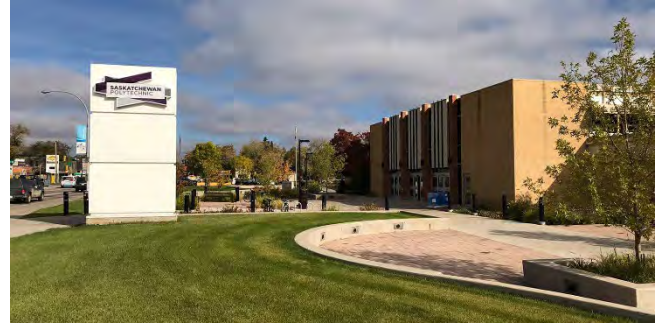
The Saskatchewan Polytechnic main campus in Saskatoon.

Saskatchewan Polytechnic currently delivers post-secondary education programs in 11 locations throughout Saskatoon. SBP and project partners are planning a new centralized campus to provide programming, training and administration services at Innovation Place Saskatoon.