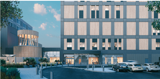
Rendering of the Prince Albert Victoria Hospital.

The agreement with PCL includes the design and construction of a new acute care tower connected directly north of the existing facility. The new tower features a heliport on the roof, an expanded emergency department, larger operating rooms, pediatrics, maternity, a Neonatal Intensive Care Unit, new medical imaging and a First Nations and Métis Cultural space, among other key services. The agreement includes an option to retain services for phased future renovations to the existing facility.