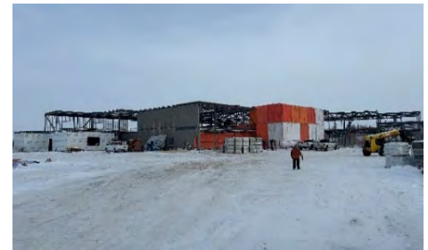
Construction progress on the new Lanigan K-12 school.