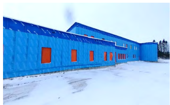
Construction progress on the new Ducharme Elementary School.

Ducharme Elementary School will feature local Indigenous cultural elements. The design was created with input from the community and features a rounded cultural centre that will be used for cultural programming and ceremonies, which incorporates architectural elements that reflect Indigenous culture. The school will have 26 classrooms, a kitchen for student meal programs, as well as a feature staircase that can be used for school gatherings.