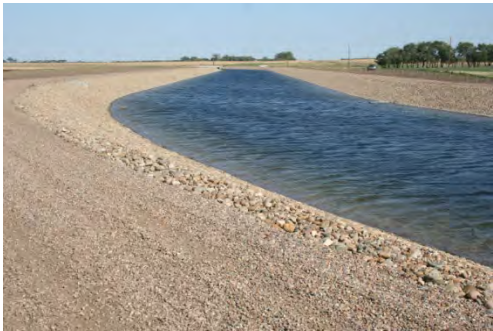
What to expect: Photo of the recently renovated Eastside Canal, east of the Westside Project.