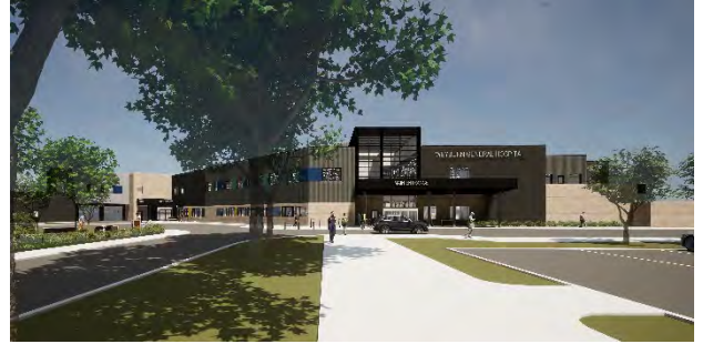
Rendering of the new Weyburn General Hospital.

The existing Weyburn General Hospital will be replaced with an integrated facility that includes 25 acute care and 10 in-patient mental health beds. The new hospital will be owned and operated by the SHA. It will also include an Emergency Medical Services garage and an adjacent heliport to support safer and more efficient patient transport.