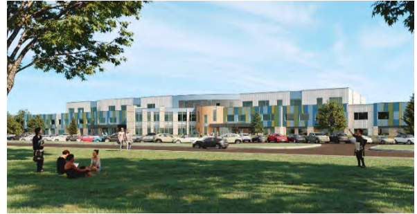
A rendering of the new Moose Jaw joint-use school.

Both sides of the facility will include adaptable learning environments, separate gymnasiums and a shared community resource space.