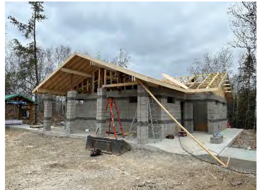
A new service centre under construction at Makwa Lake Provincial Park.

With these investments, a total of over $203M will have been invested in capital investments and preventative maintenance in provincial parks since 2007.