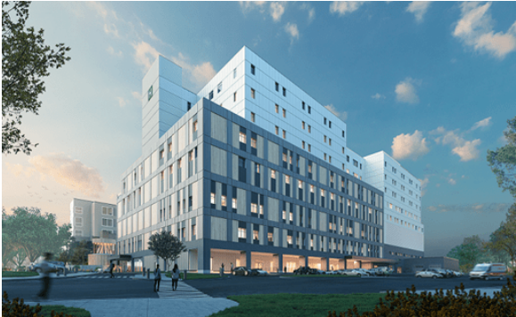
Rendering of the Prince Albert Victoria Hospital.

In February 2024, the design-build agreement was awarded to PCL Construction Management Inc. (PCL). The value of the construction contract is $898M and is inclusive of the Design and Early Works agreement awarded through a public procurement to PCL in December 2022.