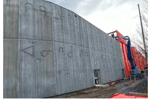
Construction progress on the new St. Frances school.