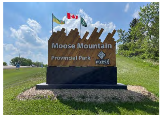
A new sign for Moose Mountain Provincial Park.