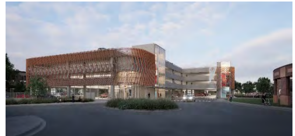
Renderings of the new Regina General Hospital parkade.

The new parkade at the Regina General Hospital will improve safety and accessibility for hospital staff, patients and visitors. It will be built in the northwest portion of the existing visitor parking lot and provide a total of 1,005 stalls, consisting of 873 stalls in the parkade and 132 surface stalls, for a net increase of 686 parking stalls.