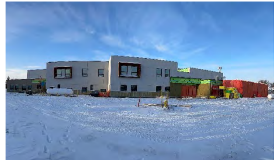
Construction progress on the new CÉF Regina school.

The Government of Saskatchewan is investing approximately $23.5M into CÉF Regina. The new school is part of a Memorandum of Understanding between the Ministry of Education and the Conseil scolaire fransaskois which includes a commitment to build three new francophone schools in the province. Regina is the first school to officially break ground with Saskatoon and Prince Albert schools currently in the pre-design phases.